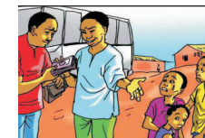
Engaging with child trafficking

Child labour deprives children from enjoying childhood and harms their physical and mental development.