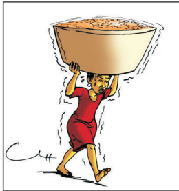
Carrying heavy loads

Hazardous Child Labour Activity Framework (MESW 2011) concerning the List of hazardous labour forbidden to children: