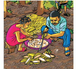
Removing cocoa beans

Child work is an activity tailored to the age of a child enabling him/her to learn certain tasks under the supervision of adults, over short periods of time.